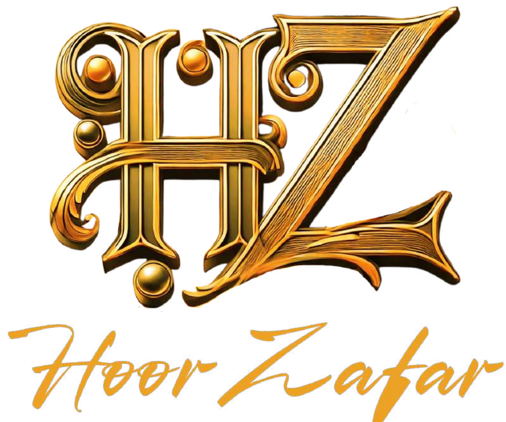
Where Heritage Inspire Couture